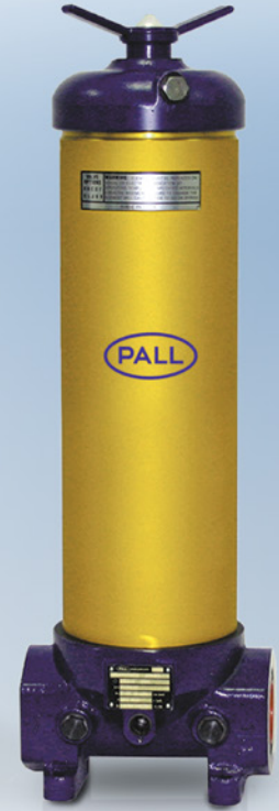
UR699 Series filter housing