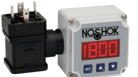
Unit with relay option.